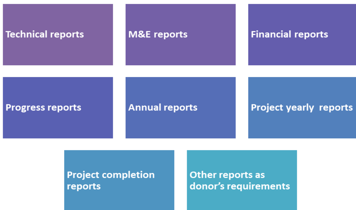
Figure 3 SDA Reporting System